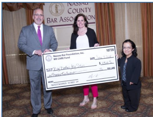
$1,500 grant from We Care Nassau County Bar Association