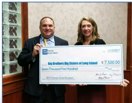
$7,500 grant from Long Island Insurance Community