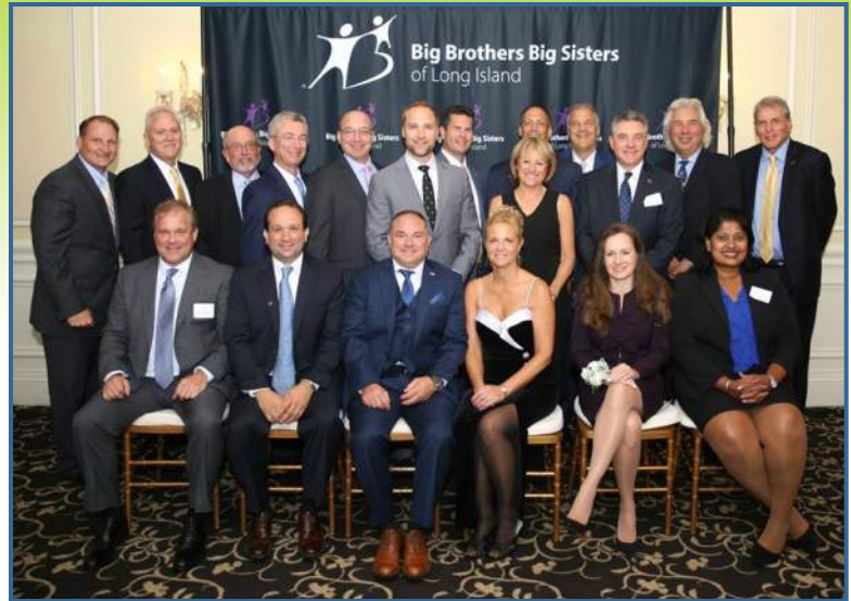
Past Gala Honorees in attendance at the event

On October 5, 2017, Big Brothers Big Sisters of Long Island hosted its Annual Presidential Gala celebrating the mentoring agency's 40th Anniversary at The Inn at New Hyde Park in New Hyde Park, NY. As the premiere fundraising event of the year, the Gala drew 300 guests and raised over $200,000 for BBBSLI to continue providing mentoring and support services to Long Island's youth.