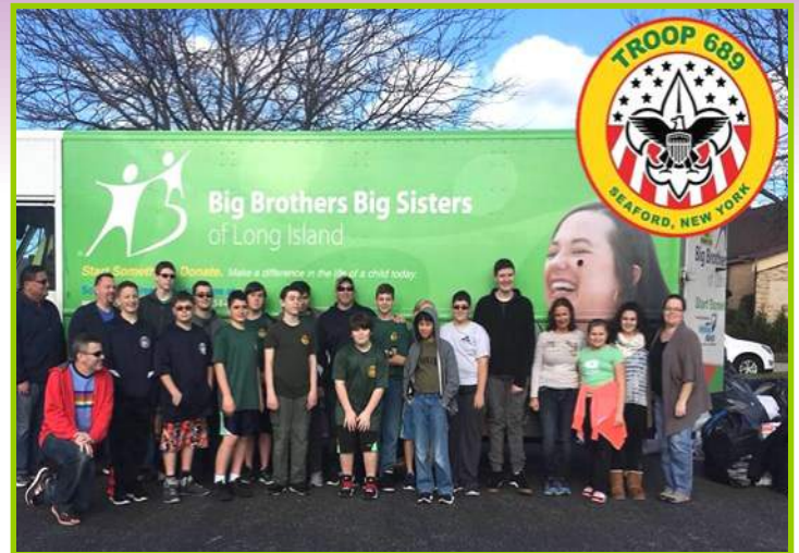
Troop 689 members and supporters helped load collections from their clothing drive on to the BBBSLI Donation Center truck.

"Organizing this clothing drive each year helps prepare our boys to become the leaders of tomorrow. Scout law teaches our members to always help other people. Helping BBBSLI with our drive is the biggest reward the boys can earn over any badge."